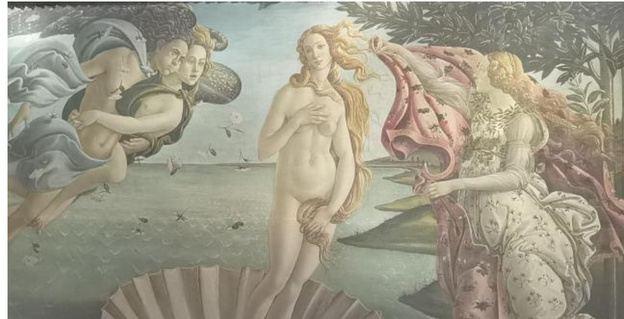
Sandro Botticelli Wiosna/ Narodziny Wenus